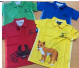
House Sports Shirt

Worn only on days students have PE Lessons or when otherwise advised. These must be worn with school shorts or skorts.